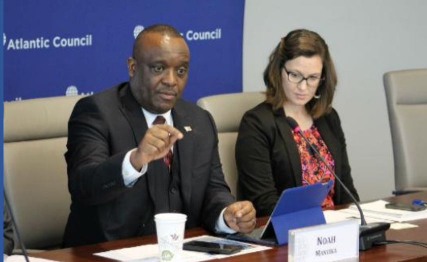
Leading discussion on bringing people, communities and nations that are lagging behind into the 21 st Century.